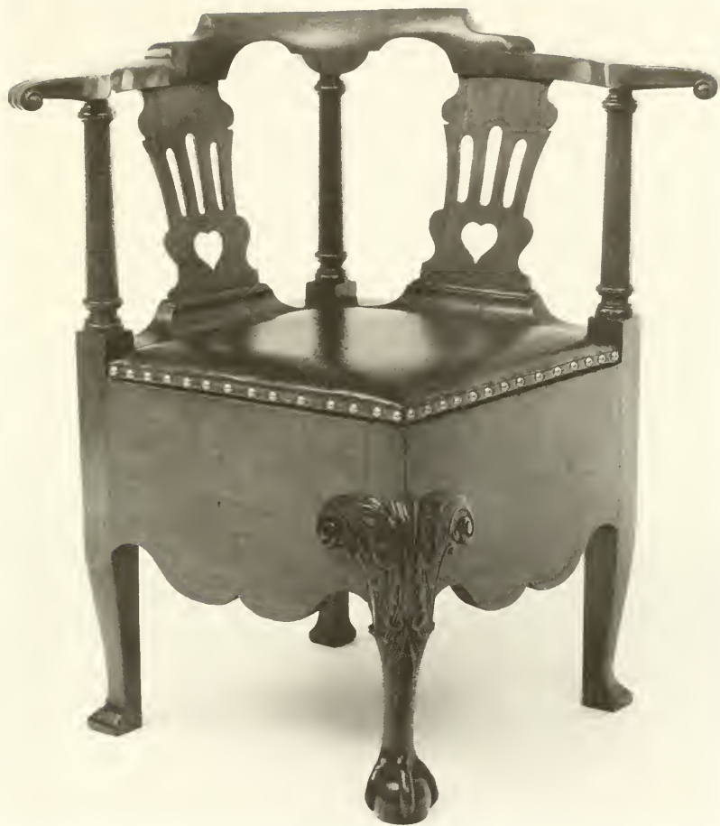
Corner chair by Peter Scott; walnut; Williamsburg, Va.; c. 1760–1775. HOA 31 \frac{7}{8} ”; WOA 18 \frac{1}{2} ”. MES-DA acc. 2921.